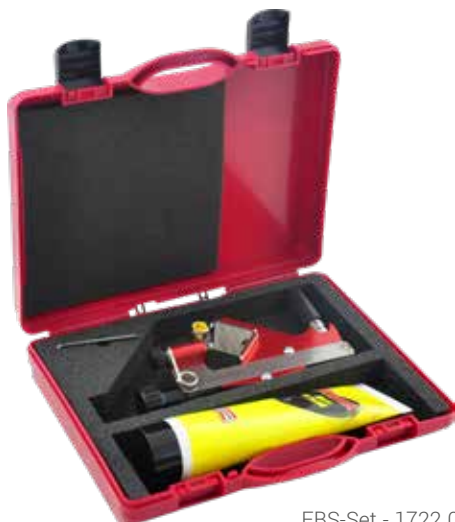
FBS-Set - 1722 0