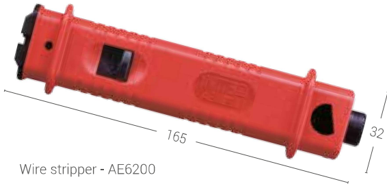
Wire stripper - AE6200