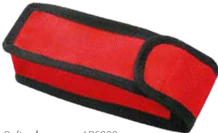
Soft nylon case - AB6200