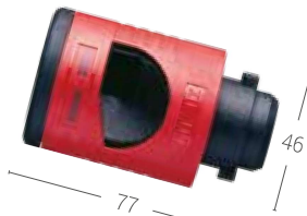
Stripping insert - AV63...