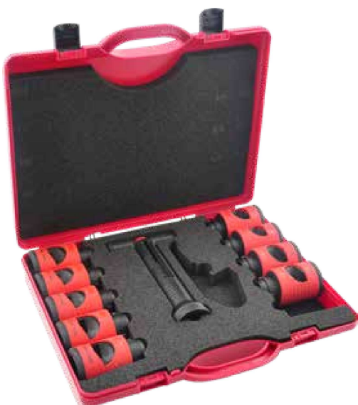
IMS 20kV-Set - AV6310