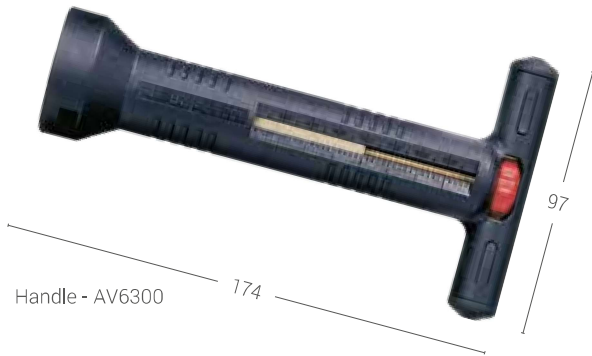
Handle - AV6300